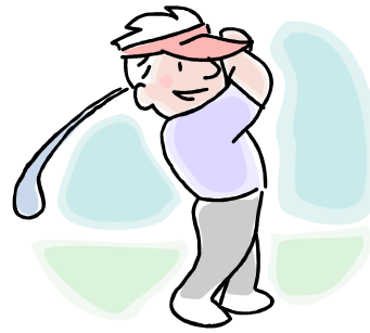
Looks like this Junior has had some subsidized lessons courtesy of the SCCJGA

The SCCJGA conducts REPS (Rules, Etiquette, Pace of Play and Safety) courses, conducts 9 hole and 18 hole tournaments, subsidizes golf lessons, tournament green fees and membership to the NCGA (Northern California Golf Association.) Being an Affiliate Member of the NCGA, SCCJGA Members participate in the NCGA's Youth on Course Program.